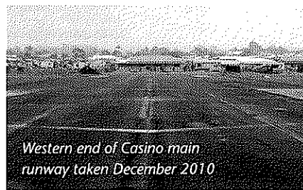
Western end of Casino main runway taken December 2010

Casino continues to be under threat to drag racing and housing development. The council has now approved 423 long term residential sites and 103 manufactured home sites alongside the aerodrome, a planning no-no. Housing is going ahead at the end of the main runway which now has a barbed wire fence across it.